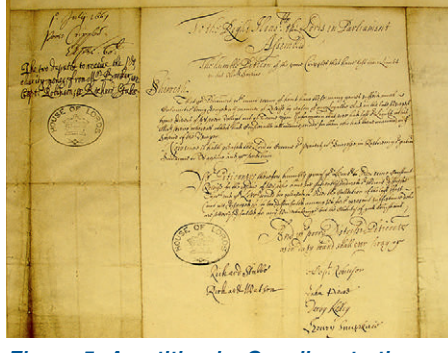
Figure 5: A petition by Cavaliers to the House of Lords after the Restoration

".. some had starved; others have attempted to destroy themselves; and many are daily likely to perish, through imprisonment, Hunger, Cold and Nakedness. And the sick and maimed soldiers now under care in the said hospital are also ready to perish for want, being not able to stir out of their beds and having no pay for these four weeks."