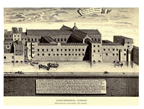
Figure 2: Savoy Hospital, opened in 1512 by Henry VII, but fell into disuse. During the Civil War, Parliament requisitioned it and used it as a hospital for its wounded soldiers. The chapel is still standing