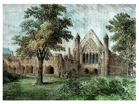
Figure 1: Ely House as it was in 1772, similar to descriptions of a century before

Whilst the governors of London's hospitals