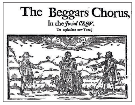
Figure 3 (Above): Contemporary depiction of an amputee, from the cover of a popular songbook of 1652

Parliament acted quickly to divert funds to the hospitals, but was sufficiently alarmed at the problems over pensions as well as other issues to consider banning petitioning altogether. Whilst they